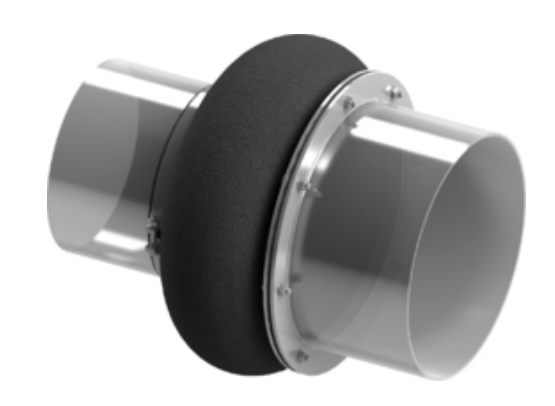
Note | Type 53 - Fabric Expansion Joint | 3D view

For detailed technical specifications on Type 53 fabric expansion joints please check the following table and documents or contact us.