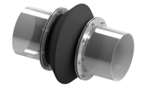
Note | Type 33 - Fabric Expansion Joint | 3D view

For detailed technical specifications on Type 33 fabric expansion joints please check the following table and documents or contact us.