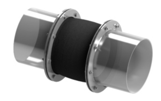
Note | Type 31 (with baffle plate) - Fabric Expansion Joint | 3D view

For detailed technical specifications on Type 31 fabric expansion joints please check the following table and documents or contact us.