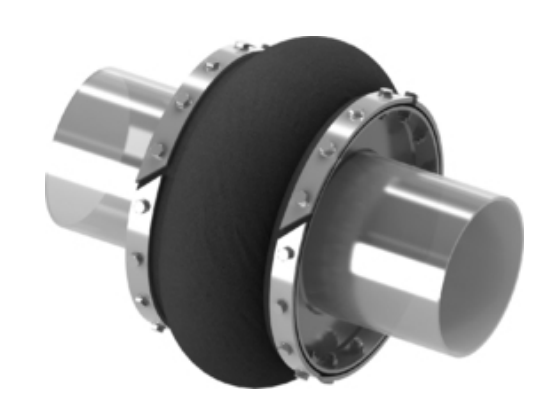
Note | Type 22 - Fabric Expansion Joint | 3D view

For detailed technical specifications on Type 22 fabric expansion joints please check the following table and documents or contact us.