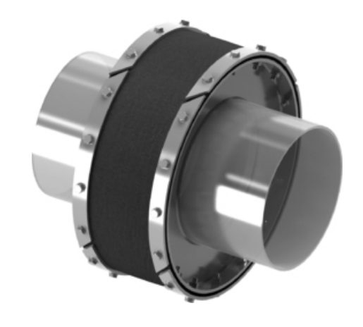
Note | Type 21 - Fabric Expansion Joint | 3D view