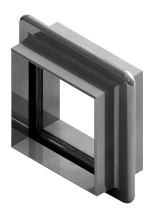
Note | Type MRU - Rectangular Expansion Joint | 3D view