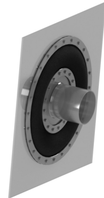
Note | Type 35 - Fabric Expansion Joint | 3D view

For detailed technical specifications on Type 35 fabric expansion joints please check the following table and documents or contact us .